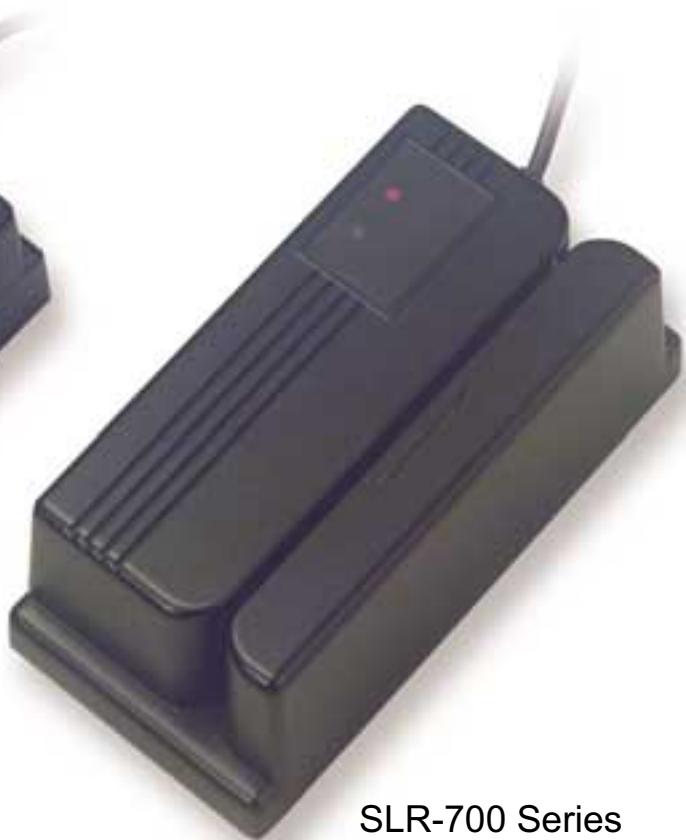
SLR-700 Series Metal Housing

The Barcode Slot Readers are designed to provide excellent scanning performance on a wide variety of barcode cards, badges, tags or printed forms.