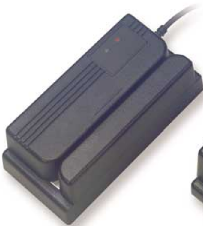
SLR-70 Series Plastic Housing