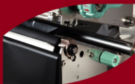
Adjustable sensor kit