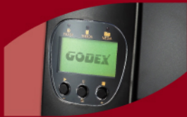
Upgrade Graphic LCD