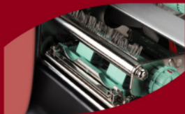
Modular concept printerhead