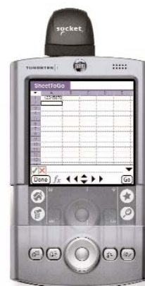
SDSC 3E and Palm Tungsten