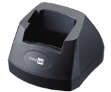
Charging and Communication Cradle