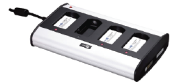
4-slot Battery Charger