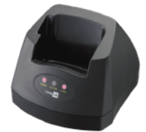
Modem Cradle Ethernet Cradle